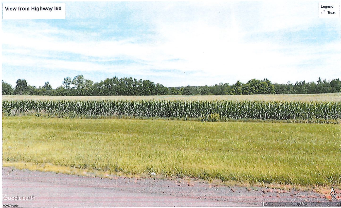
The site cannot be seen from I90 due to topography and vegetation on the south side of the river.