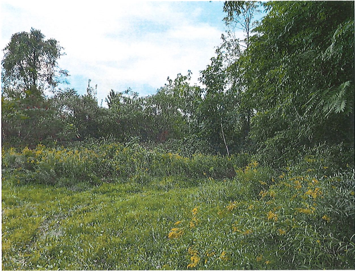
This photo was taken from the end of Gay Lane where it enters the site and is facing south. The adjacent early years center is also well screened by existing vegetation.